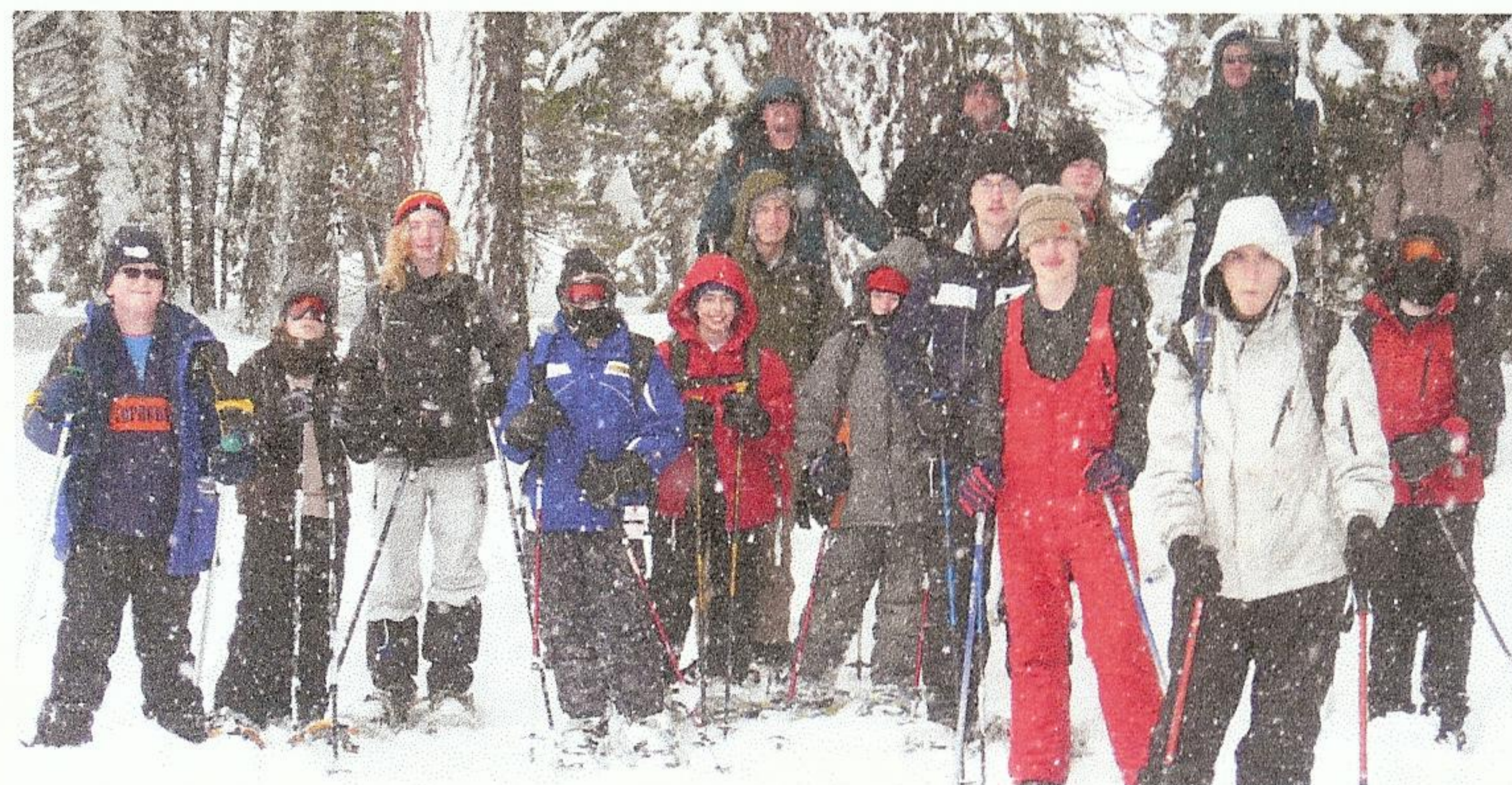
Group Picture at the lake