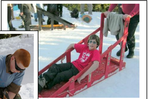
our snow trips